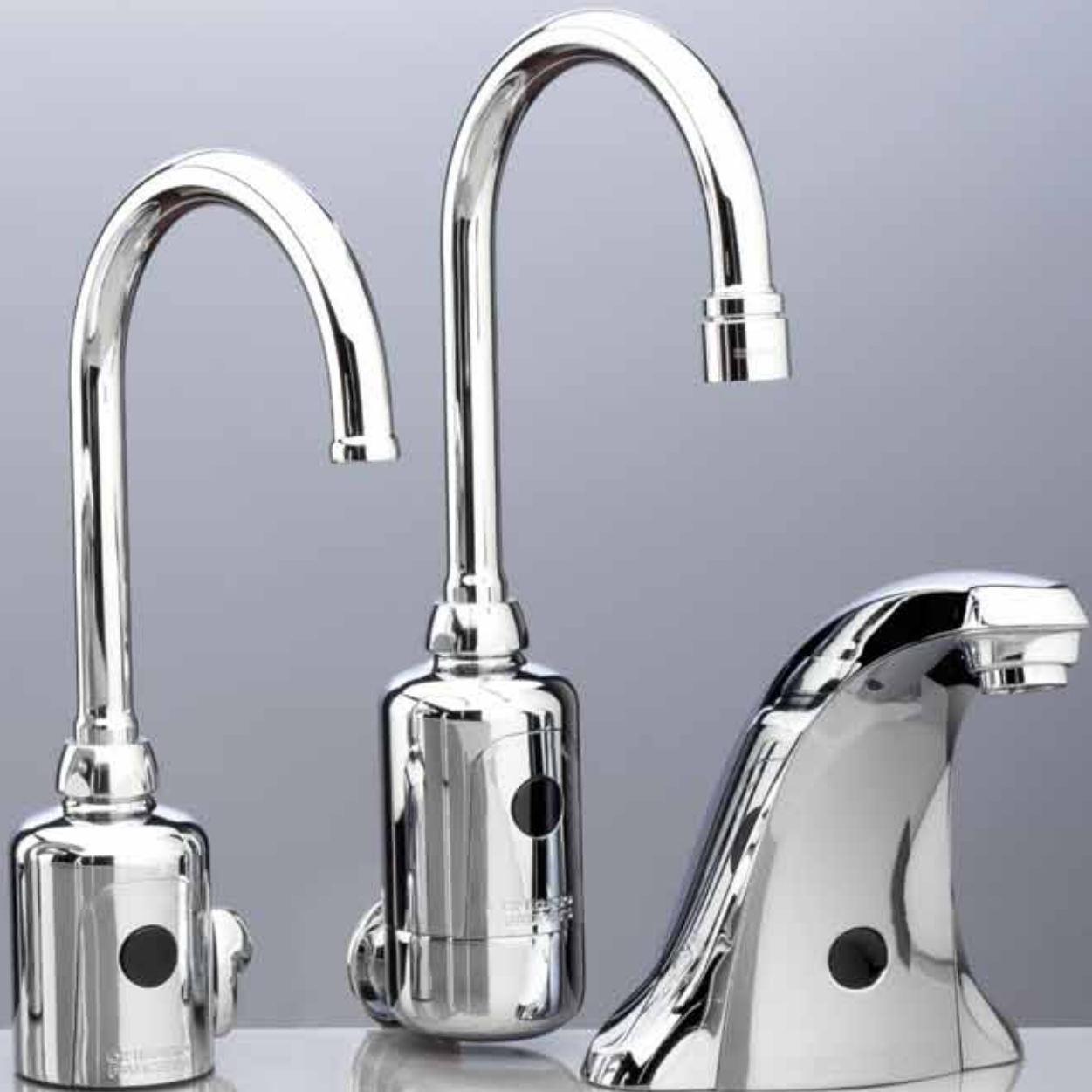
HyTronic® Deck Mount and Wall Mount Gooseneck