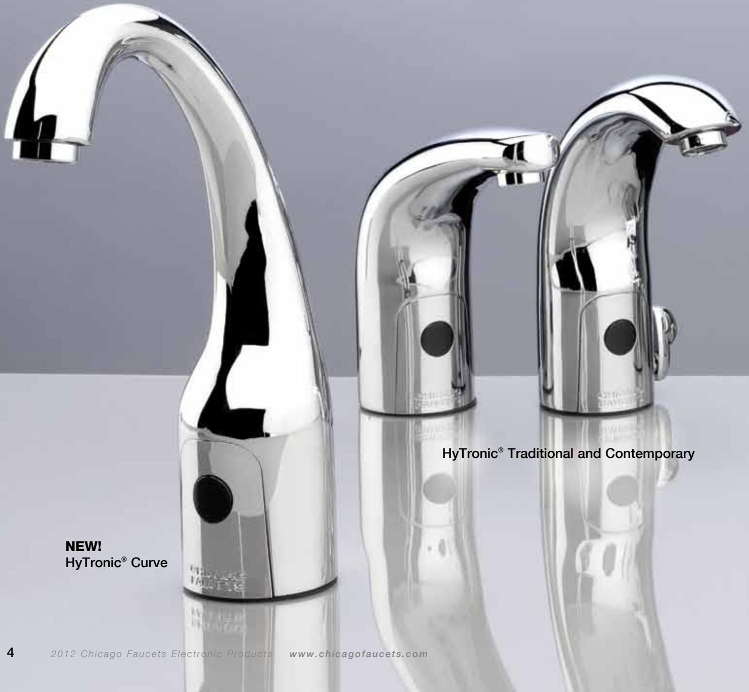
NEW! HyTronic® Curve

We offer a faucet to meet any design and budget, including stylish lavatory faucets and functional goosenecks for both deck mount and wall mount applications.