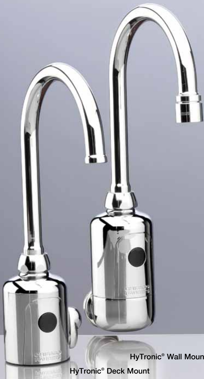
HyTronic® Wall Mount