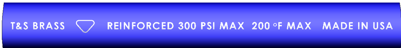
DETAIL A SCALE 1 : 1