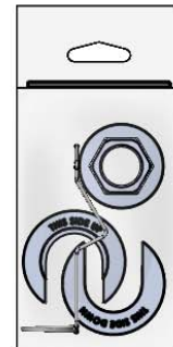
017245-40 Installation Repair Kit Includes #5, (2)#9, & #10